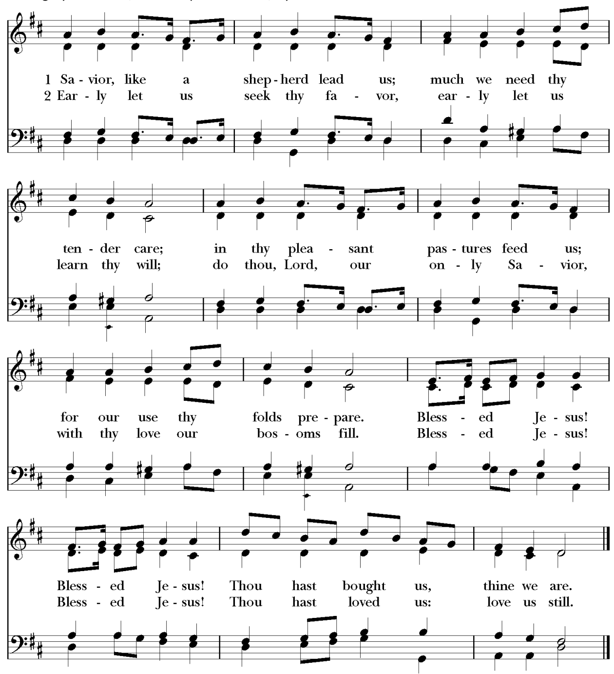
Words: Hymns for the Young, ca. 1830, alt. Music: Sicilian Mariners, Sicilian melody, from The European Magazine and London Review, 1792

Closing Hymn: Savior, like a shepherd lead us, Hymnal 708